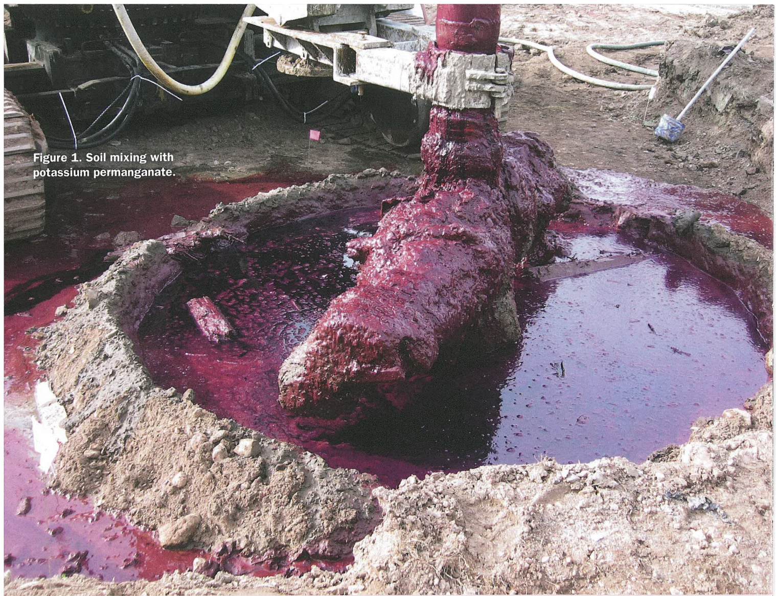
Figure 1. Soil mixing with potassium permanganate.