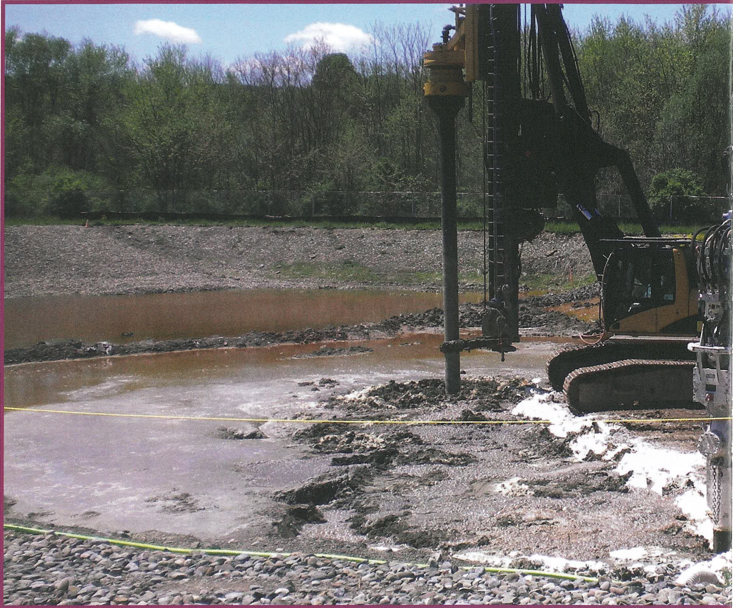
Figure 3. Chemical reagent injection (L) and hot air stripping (R).

The work was completed over a 10-week timeframe, including mobilization and demobilization. Post-construction samples indicated that a reduction in the average acetone concentrations of more than 75 percent had been achieved, with further reductions anticipated from enhanced biodegradation (Figure 2).